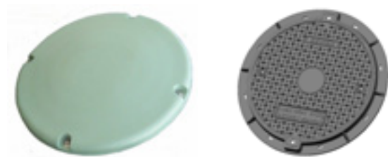
Ø600 fitted polyethylene or composite resin access cover