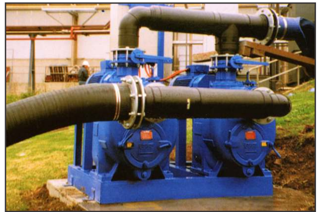
Effluent Pumping System at major Milk Factory

Units are factory tested and operating parameters pre-set prior to delivery.