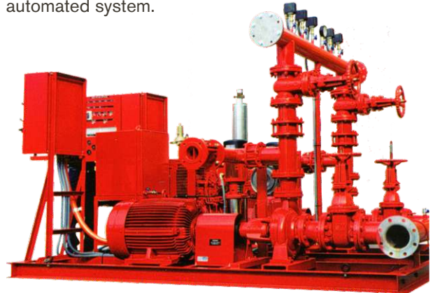
Diesel/Electric Fire Pumpset for major Hotel Complex

Fire Protection Pumpsets are available in diesel and electric drive configurations, assembled on a common fabricated base with pipework manifolds, valves and electrical controls to provide a fully automated system.