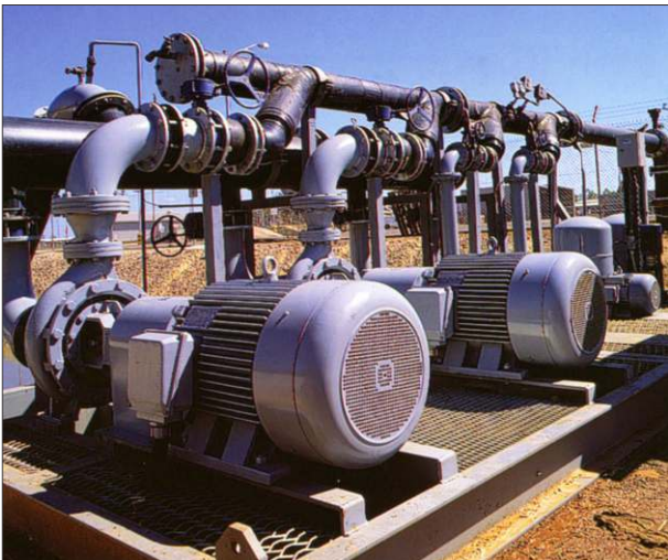
Fully Automated 5 Pump Water Supply Pumping System

In their simplest form, these consist of one or more pumps with cascade pressure switch control. The system can be further enhanced by a dedicated pump controller fed by one or more pressure transducer with multiple-pump capability.