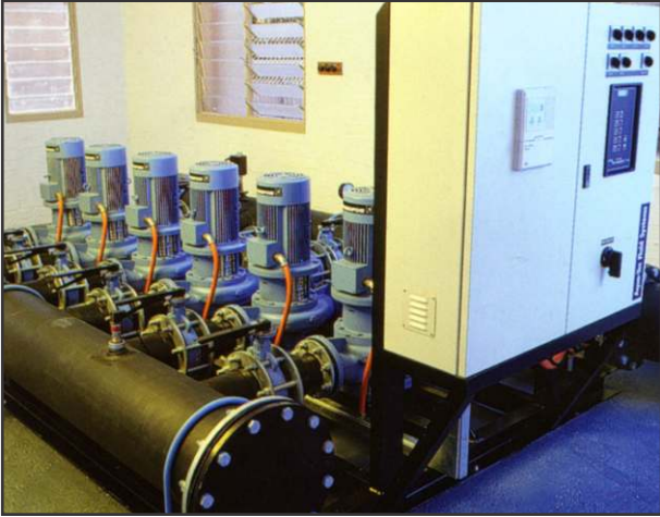
Variable Speed Booster set for town water supply